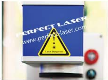
Laser Scanning Head