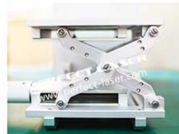
3D Working Table