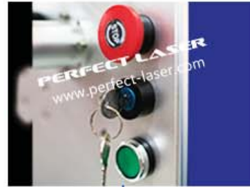
Emergency Stop Key Switch Main Switch